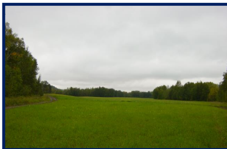
Proposed Kanata Extraction Area, facing south from north end

As part of a multi-disciplinary team, Sameng Inc. assisted in completing an Environmental Impact Assessment for the project and collaborated in a stakeholder consultation process, which included a Technical meeting with Regulatory Agencies, an Open House for the public and presentations to Edmonton City Council and Administration.